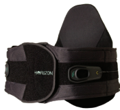
Horizon 631 LSO