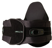
Horizon 637 LSO