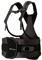
Horizon 456 TLSO

Easy to fit and adjust sizes. Use indicator references to quickly match up to waist measurements or pant sizes.